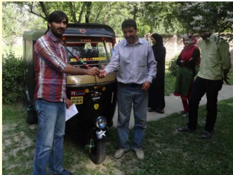
Manager Programs CHINAR handing over the keys of a Three wheeler to a beneficiary from Srinagar under CHINAR's RFSP.