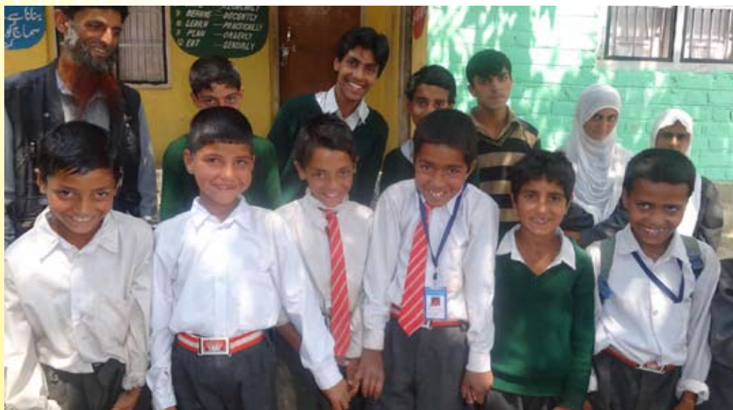
Children of Zampathri giggling during a funny picture taking moment at their school.